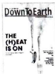
◀ Cover design: Ajit Bajaj

2020 saw record harvests, but ended with protests against new farm laws